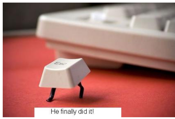
He finally did it!